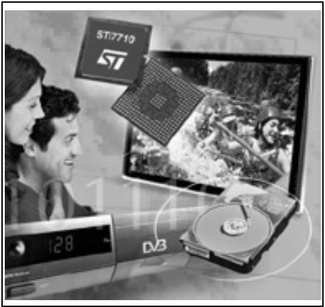
Figure 1. Package

The STi7710 embeds a wide range of peripherals, including a high-speed USB host interface, and provides connectivity options, including the ability to provide DVR capability.